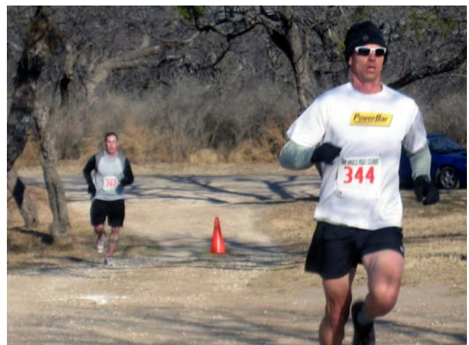
A Close Finish at the 10km Trail Run