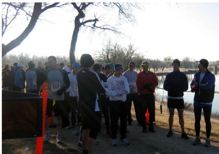
Chilly morning start at the Trail Run